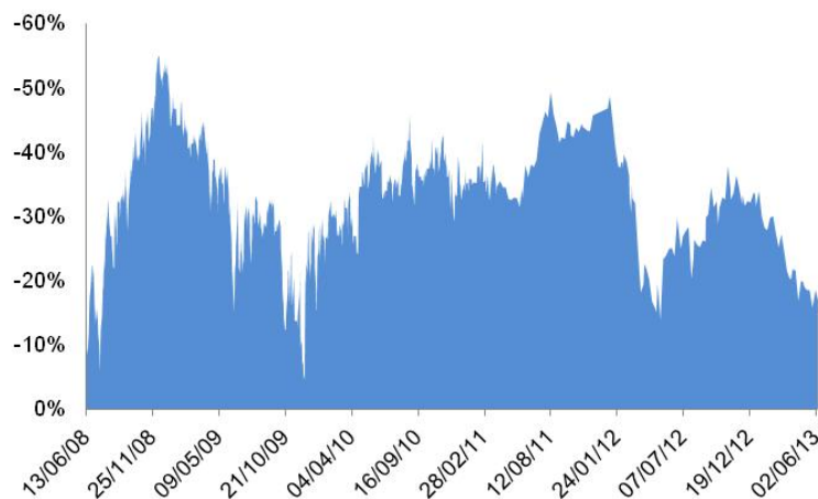
Market price vs NAV per unit